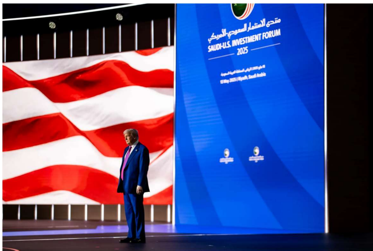
President Trump's leadership is remaking the world into a more peaceful and prosperous place, including the Middle East.

foundation that President Trump has laid through his clear-eyed, tireless diplomacy. To that end, DoW will empower regional allies and partners to take primary responsibility for deterring and defending against Iran and its proxies, including by strongly backing Israel's efforts to defend itself; deepening cooperation with our Arabian Gulf partners; and enabling integration between Israel and our Arabian Gulf partners, building on President Trump's historic initiative, the Abraham Accords. As we do, DoW will maintain our ability to take focused, decisive action to defend U.S. interests. Through this approach, we can set and reinforce conditions for lasting peace through strength in the region.