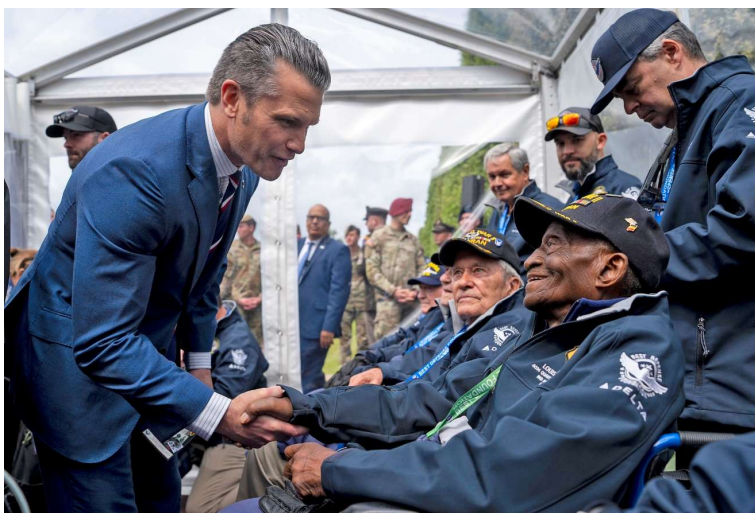
Secretary of War Pete Hegseth meets with World War II veterans in Normandy, France, on the 81st Anniversary of D-Day. These American heroes exemplify the warrior ethos at the heart of the U.S. military.

None of this was foreordained. America emerged from the Cold War as the world's most powerful nation by a wide margin. We were secure in our hemisphere, with a military that was focused on warfighting and far superior to anyone else's, engaged allies, and powerful industry. But rather than husband and cultivate these hard-earned advantages, our nation's post-Cold War leadership and foreign policy establishment squandered them.