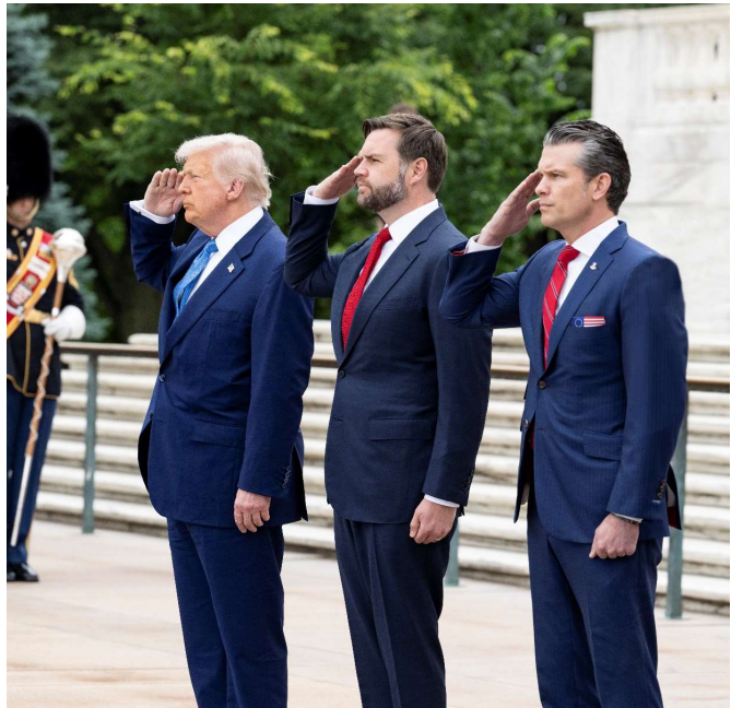
President Donald J. Trump, Vice President JD Vance, and Secretary of War Pete Hegseth render honors during a Memorial Day Wreath-Laying Ceremony at the Tomb of the Unknown Soldier at Arlington National Cemetery, Arlington, Virginia.

But we at the Department of War will be ready if our gracious offer is spurned. We know that wishing for a decent peace is not the same thing as bringing it about. Thus, if our potential opponents are unwise enough to reject our peaceful overtures and choose conflict instead, America's armed forces will stand ready to fight and win the nation's wars in ways that make sense for Americans. To ensure that is the case, this Strategy will ensure that we see things and the choices we need to make clearly. We will prioritize addressing the most consequential and grave threats to Americans' interests. We will revamp our network of allies and partners to meet the threats we face. And we will be ready, always carrying the sharpest and most formidable sword but prepared to offer the olive branch.