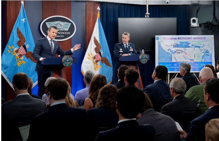
Secretary of War Pete Hegseth and Chairman of the Joint Chiefs of Staff General Dan Caine brief the success of Operation MIDNIGHT HAMMER.

a short, sharp, and decisive campaign, the President was able to restore freedom of navigation for U.S. vessels.