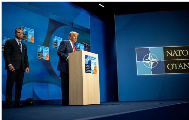
President Donald J. Trump speaks at the NATO Hague Summit after securing historic defense spending commitments from our NATO allies.

It is only prudent for the United States and its allies to be prepared for the possibility that one or more potential opponents might act together in a coordinated or opportunistic fashion across multiple theaters. Such a scenario would be less of a concern if our allies and partners had spent recent decades investing adequately in their defenses. But they did not. Instead, with rare exceptions, they were too often content to allow the United States to defend them, while they cut