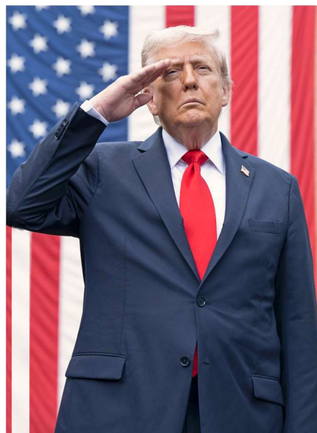
President Donald J. Trump salutes during the Pentagon's 9/11 Observance Ceremony on September 11, 2025.

The core logic of this Strategy, consistent with President Trump's historic and needed shift, is to put Americans' interests first in a concrete and practical way. This requires being clear-eyed about the threats that we face, as well as the resources available to both us and our allies to confront them. It requires prioritizing what matters most for Americans and where